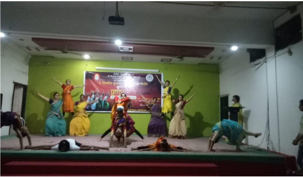
Name of the Activity :Career Guidance and Counseling Cell